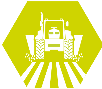
Sowing / Planting